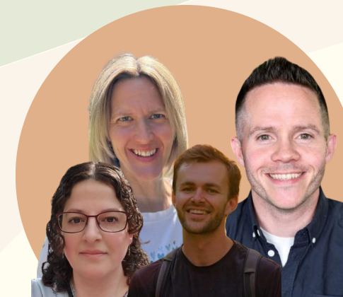
PREFERRED BY NATURE

Preferred by Nature is a global non-profit working to drive sustainable impact for people, nature and climate through a combination of sustainability certification services, tailored services, strategic projects, and training. They will present their work, their internship program, and the EMMA4EU project which aims to build a deforestation-free training network. EMMA4EU offers free training for students and professionals, and offers the possibility of joining the network for free resources on deforestation-free supply chains, such as courses, workshops, articles, and job and internship postings.