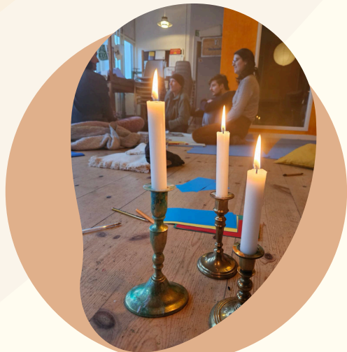
ANNA, MAX, & VERENA

In an era of cascading crises, taking time to dream of the best future we can imagine might seem like a luxury we can't afford. But what if our ability to imagine bold possibilities together is what could help us right now? This workshop creates a safe and brave space for both individual and collective dreaming. Through guided meditation and creative exchange, we'll connect to our vision for an ideal world—tapping into creativity that daily overwhelms might have buried. What threads will connect our personal utopias? How can our shared dreams spark real-world action? Leave with a dose of hopeful optimism, ideas for action, and connections with fellow dreamers ready to turn vision into reality.